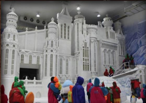
SNOW KINGDOM, CHENNAI