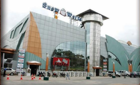
SNOW WORLD, LOWER TANK BUND ROAD, HYDERABAD