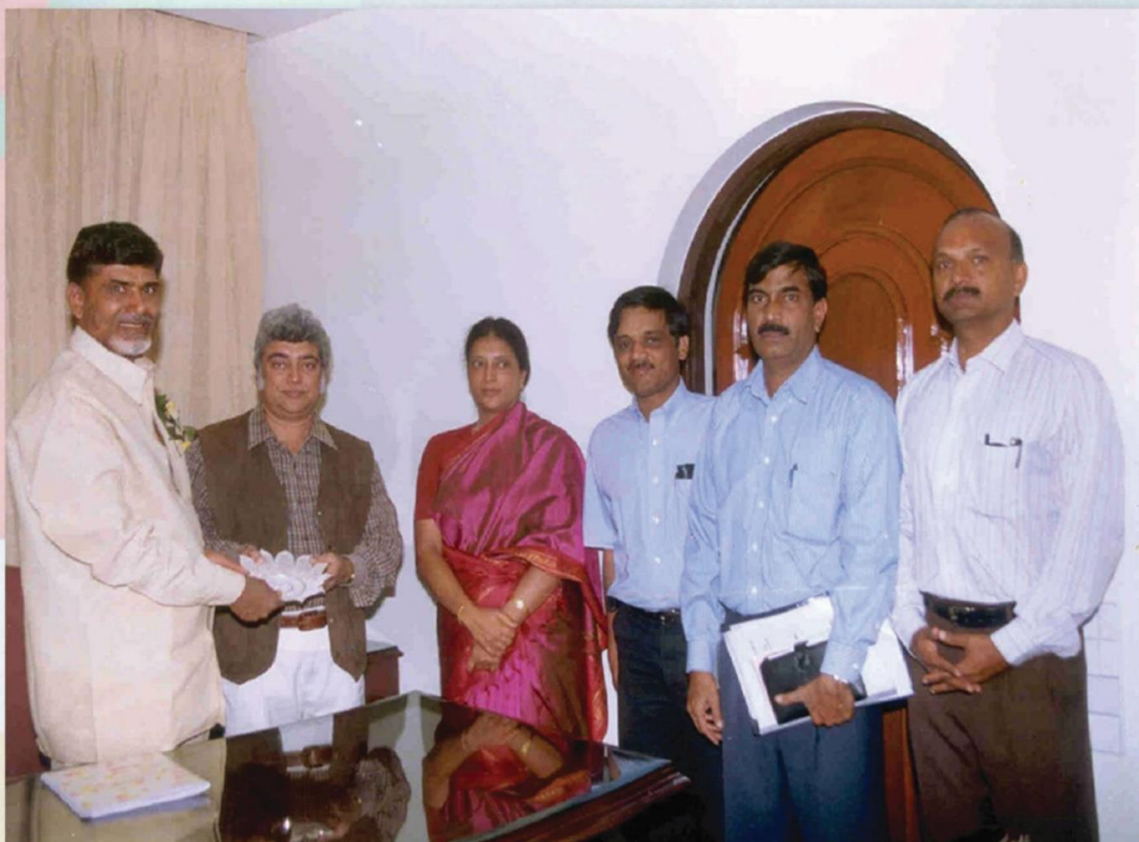
Presentation of award after complition of N.T.R. Garden ( 1998 - 2000 ) by the Hon'le chief minister Sri. N. Chandrababu Naidu in 2001.