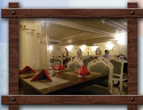
DHAKA SIRAJ, BANGLADESH

This is a restaurant with a retro look. The distinctiveness of this place appears to be in its looks and ambiance -- wall paper with vintage sports car images and huge posters of the likes of Marylin Monroe and Elvis Presley, a mock vintage car thrown in too, with a waft of old-style country western tunes in the background.