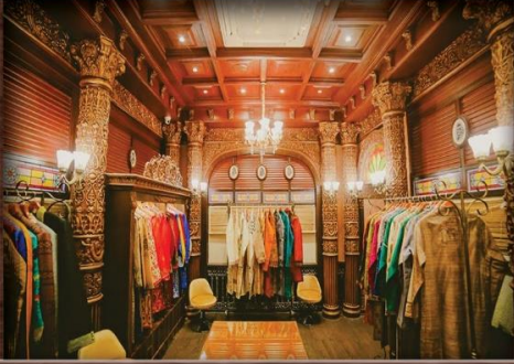
SHUNYAA SHOWROOM, KOLKATA