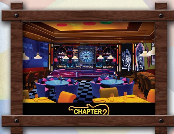
CHAPTER 2 KOLKATA

The overall theme of the restaurant is that of jungle and is very well done, artificial trees, some sounds, animals etc and hence is a great place to be with family, kids, friends etc.