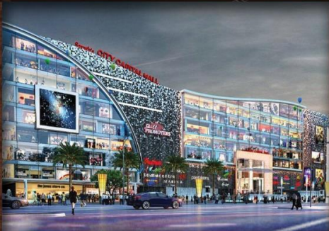
CAPITAL MALL, HYDERABAD

Studio Art designed and executed the construction of snow theme parks that provides absolute thrill and satisfaction to the visitors. The themes are a unique one with snow slide, snowfall, merry-go-round, snow disco, Santa House, Igloo Hut and snow themed restaurant. Visitors can also meet with miniatures of different animals that are common in lands of snow.