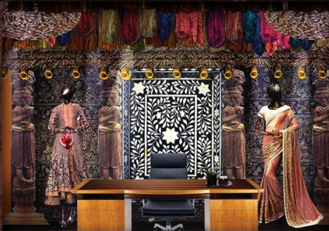
TANTUJA, KOLKATA, WEST BENGAL

A carefully designed showroom that suites the best of artefacts that is to be sold from there.